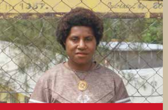
Ruth / Papua New Guinea

MARCH Lord, as we commit to You, establish Your purposes in us. We ask that You guide CBM field workers as they challenge child labour practices and advocate for children's safety and education.