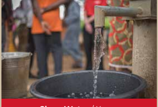
Clean Water / Kenya

BLINDNESS: Join us in prayer to lift up CBM's partners, and their tireless efforts to provide access to surgeries, medications and preventative treatments for people in the world's poorest places.