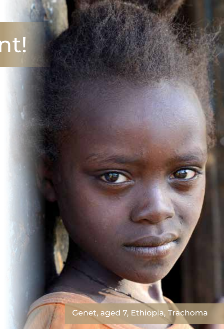
Genet, aged 7, Ethiopia, Trachoma

This is because your gift can allow cbm to make long-term plans, and invest in cost-effective programs that reach those most in need. You will be bringing help to the world's most vulnerable children, long into the future.